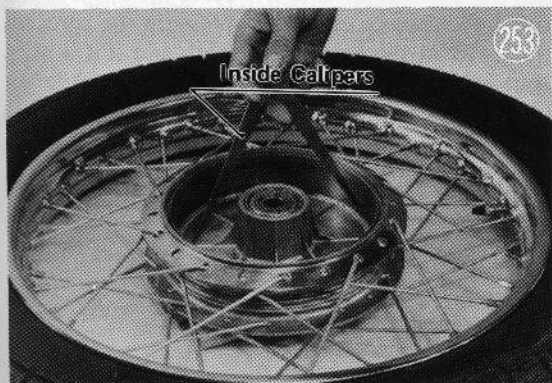
Table 29 Inside Drum Diameter

After long use, the inner surface of the brake drum wears down from friction with the brake shoes. Measure the inside diameter of the drum and replace it if it is worn out of tolerance.